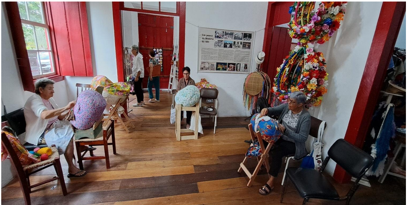
Lace making in Florianópolis, Santa Catarina, Brazil